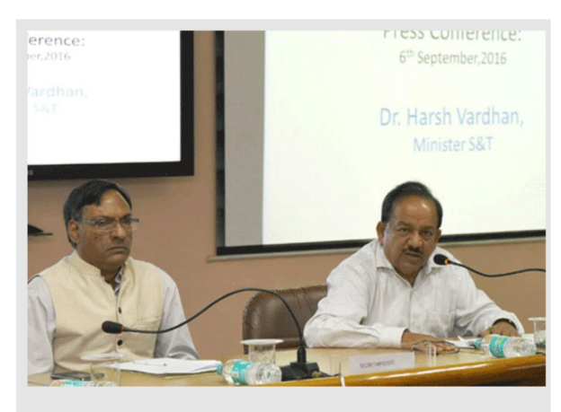
DST commits Rs 500 crores for PM's vision on Startup India

New Delhi, Sep 7 (KNN) In order to realize the Prime Minister's ambitious Initiative on Startup India, Department of Science & Technology (DST) aims to bring both speed and scale to transform the Startup Ecosystem in the country and has committed 500 crores to implement these new programs in next few years.