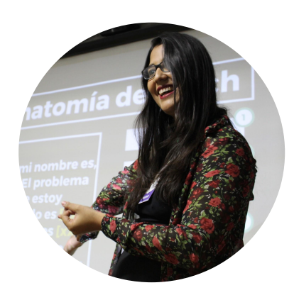
60 Seconds to Pitch

From the top projects - Choose which one you'll work on over the weekend.