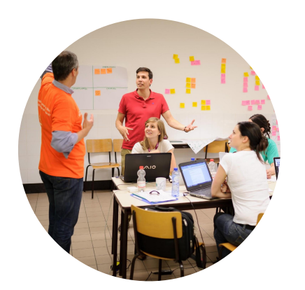
Choose your project

Get to know your new friends. Meet the people you'll be working with.