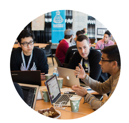
Build a Team

Got an idea? You've got 1 minute to pitch in front of the group.