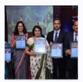
Intel, SINE And DST Collaborate To Launch Hardware Startup Incubator 'PlugIn'